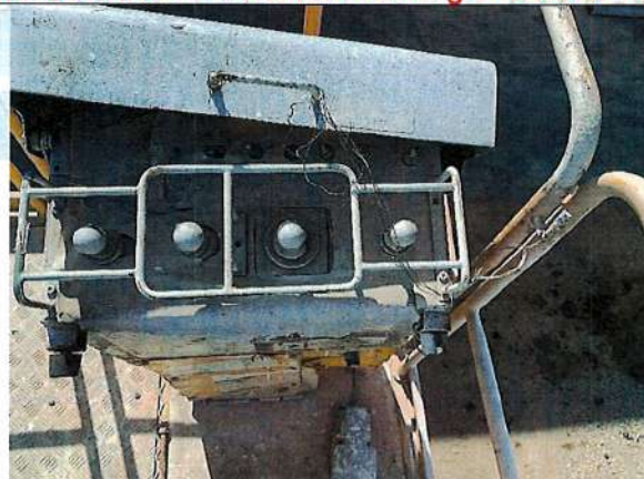
Box of control tied by wire