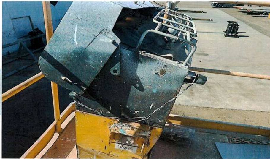
Basket contro Levers not working should be fixed